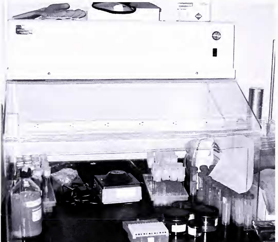
Figure 2: A laminar flow hood in my lab. This model cost about US$1500 (in 2003) and is about 1.3 m wide by 0.8 m deep by 1 m high (4 ft by 2.5 ft by 3 ft).